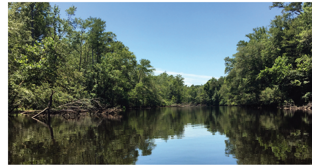
Lumber River State Park $340,000 in active funding