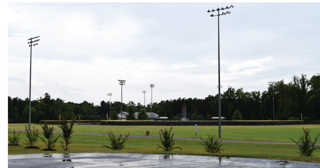
Granville Athletic Park in Oxford, NC Local LWCF funding received in 2001 and 2016