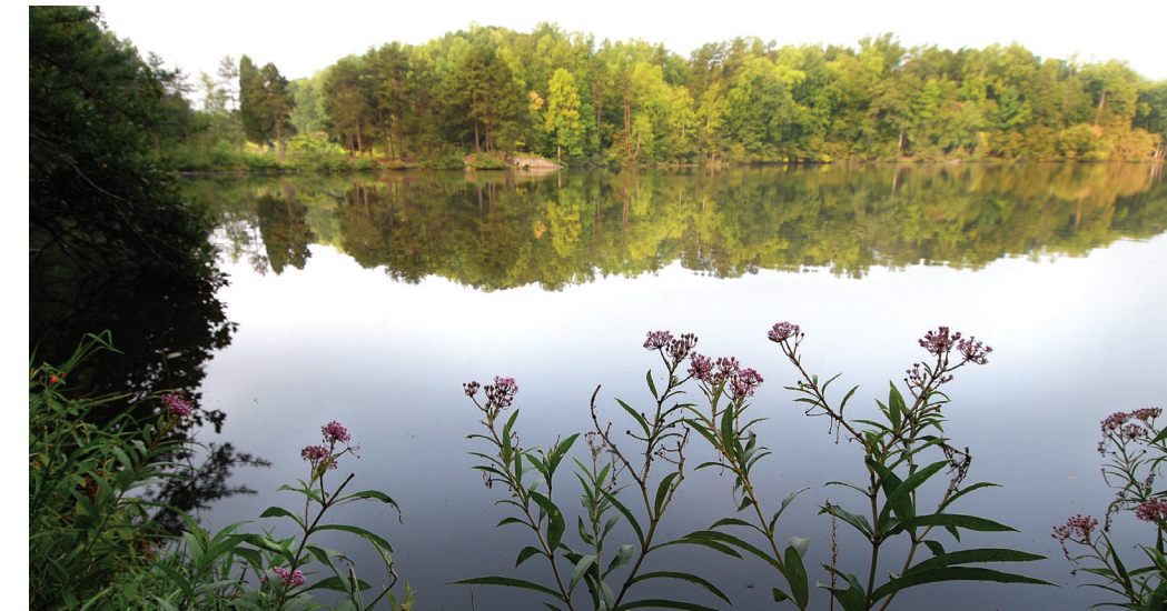
Lake Norman State Park LWCF funding received in 1967, 1972 and 1981