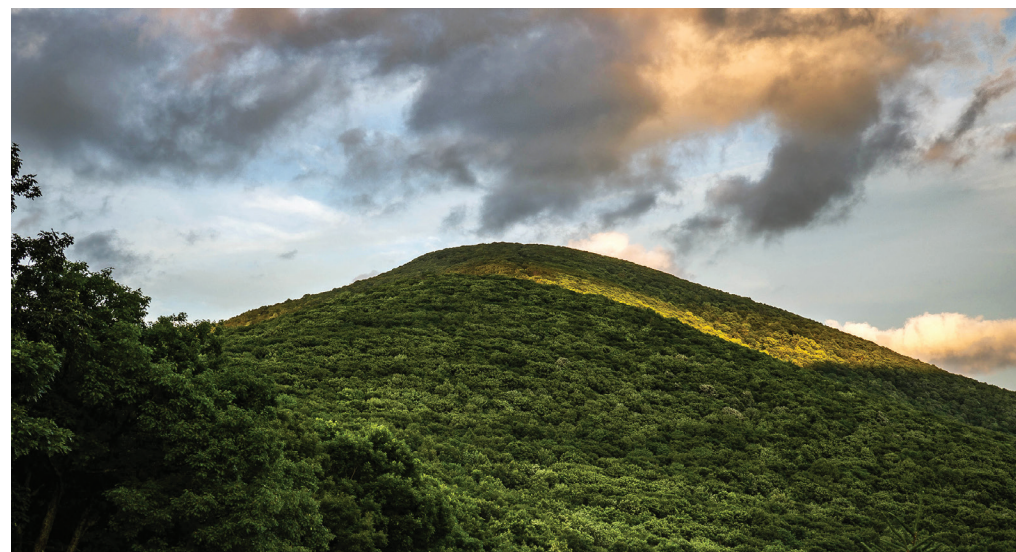
Elk Knob State Park $468,747 in active funding