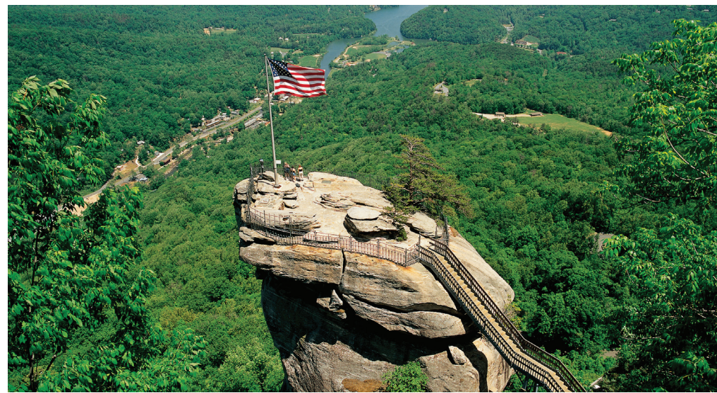
Chimney Rock State Park Protected with Land and Water Conservation Funds for countless generations of future recreational use. LWCF funding received in 2010 and 2014