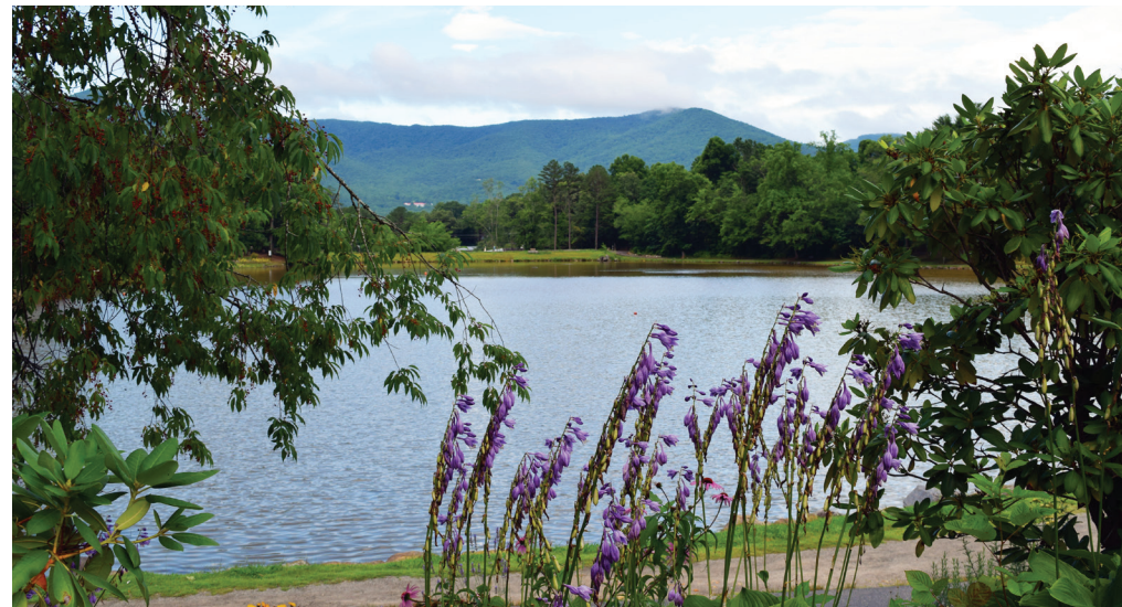
Lake Tomahawk Park in Black Mountain, NC LWCF funding received in 1983 and 1986